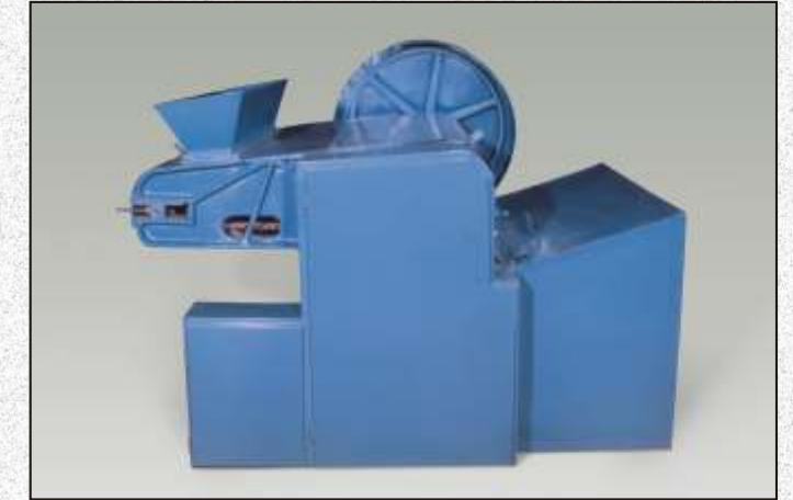
WET FIBER OPENER

The Conveyor and Hopper Feeder system is used for larger capacity machines to load fiber uniformly on the conveyor. It consists of a chain driven steel conveyor which transports the fiber from the wet cotton opener and delivers to the hopper feeder. The Hopper Feeder consists of a series of spiked elements which transports the material to the dryer through a "comb" device, which prevents lumps and excess material going to the conveyor.