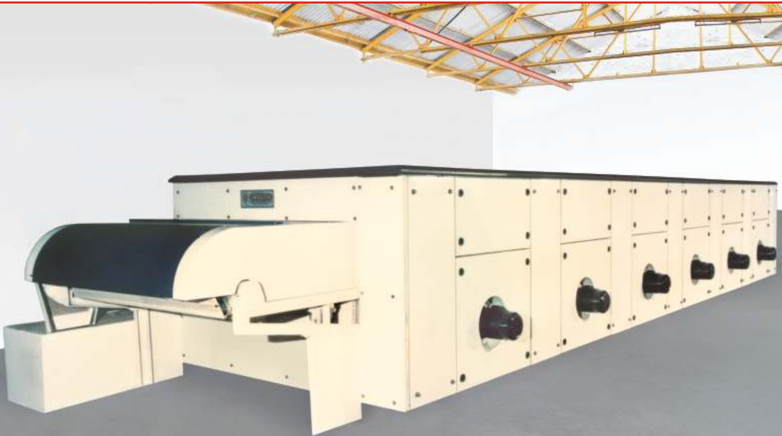
Model LFD - 160

SWASTIK GROUP OF COMPANIES, AHMEDABAD, INDIA