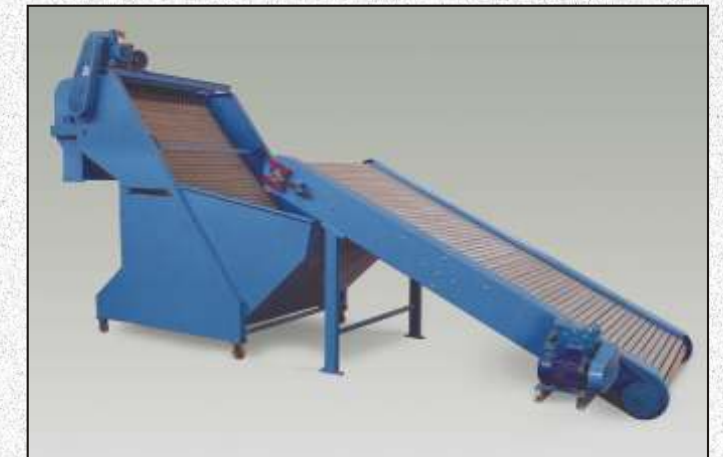
CONVEYOR & HOPPER FEEDER